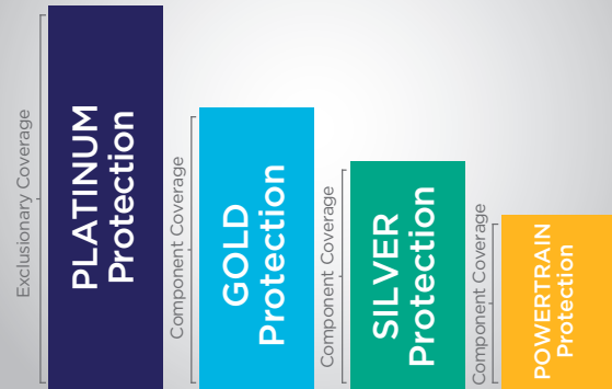
For illustration purposes only.

Protection covers everything that GOLD Protection does, plus much more. (3)